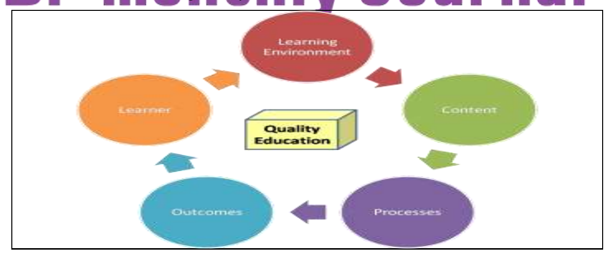
Fig. 1: Quality Education. (myedumusing.files.wordpress.com)

Finally, improving the quality of school education considered from the three aspects mentioned above should be a fundamental policy issues in all countries, whatever their circumstances, in the coming century.