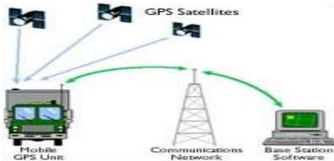
Fig.2. Basic Architecture