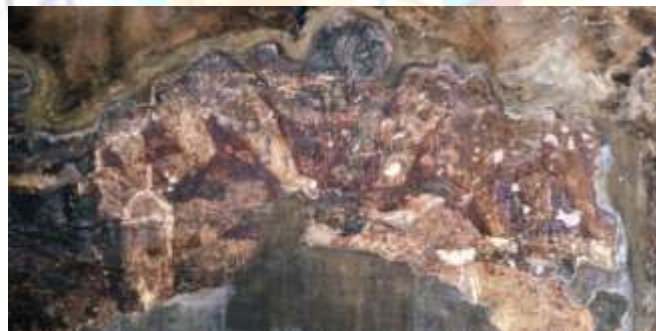
Cave Number 17 East wall, Removal of chalkiness

The unstable micro climatic conditions in the caves affected the state of conservation of the mural paintings. Due to the impact of variation in relative humidity, a portion of painted plaster along with mud had fallen from its stone carrier. Falling of white pigments from the ceiling of cave No.2 was also noticed. The thick coat of protective layer applied on the paintings by the earlier, restorers, accumulated dust, soot, excreta of bats etc had created an obscuring haze over the murals.