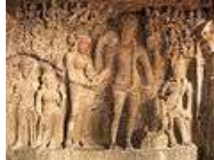
Nataraj in Kailash Temple at Ellora cave no 19, Wall carvings at Ellora cave