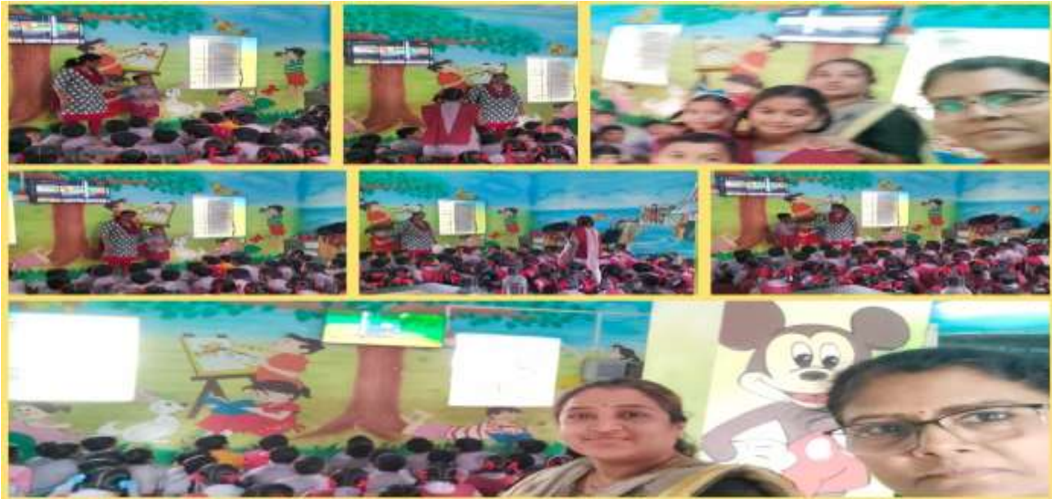
The story of The Lion and the mouse was shown by the teacher on You tube. The teacher asked students to write maximum number of English words from the story