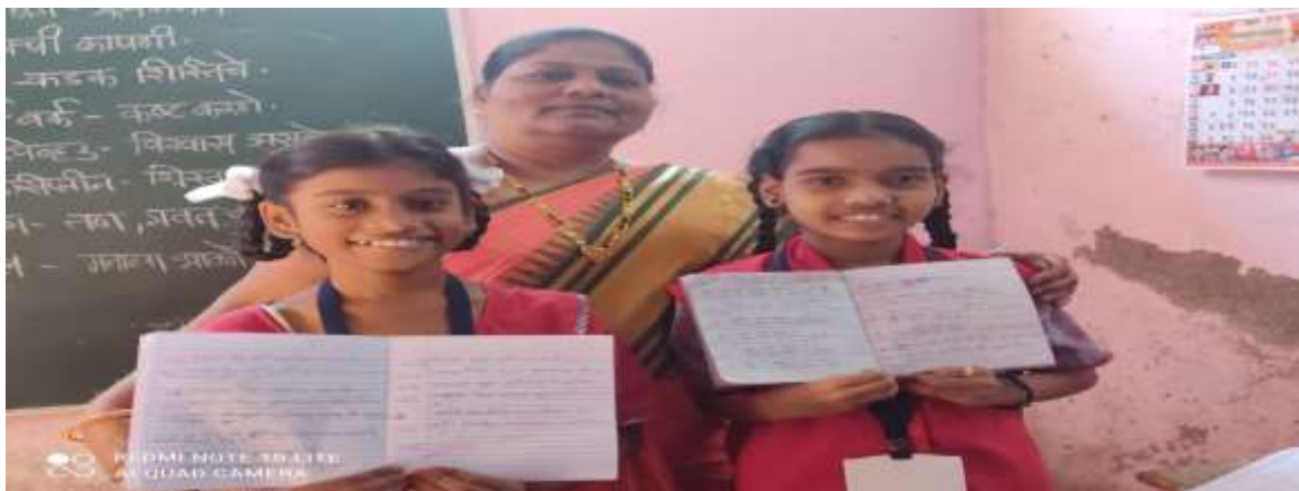
Students of Std VI prepared maximum questions for Quiz based on our leaders