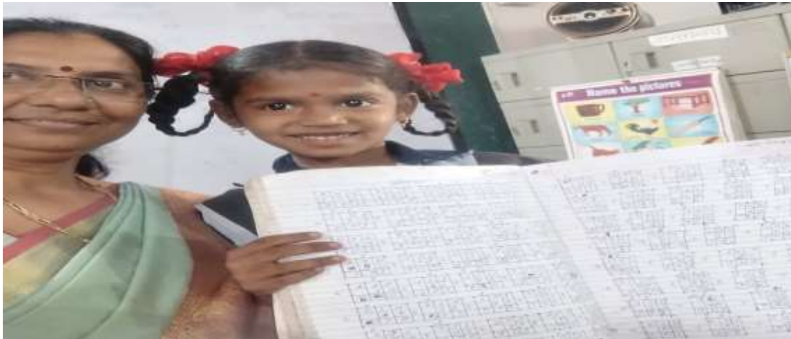
Framing Math's Questions