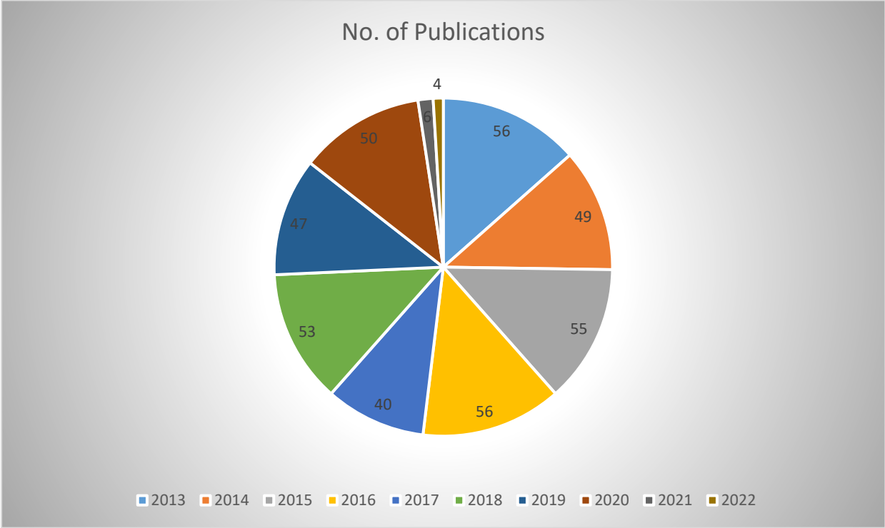
Source: Author’s calculation Fig. 2 No. of Publications