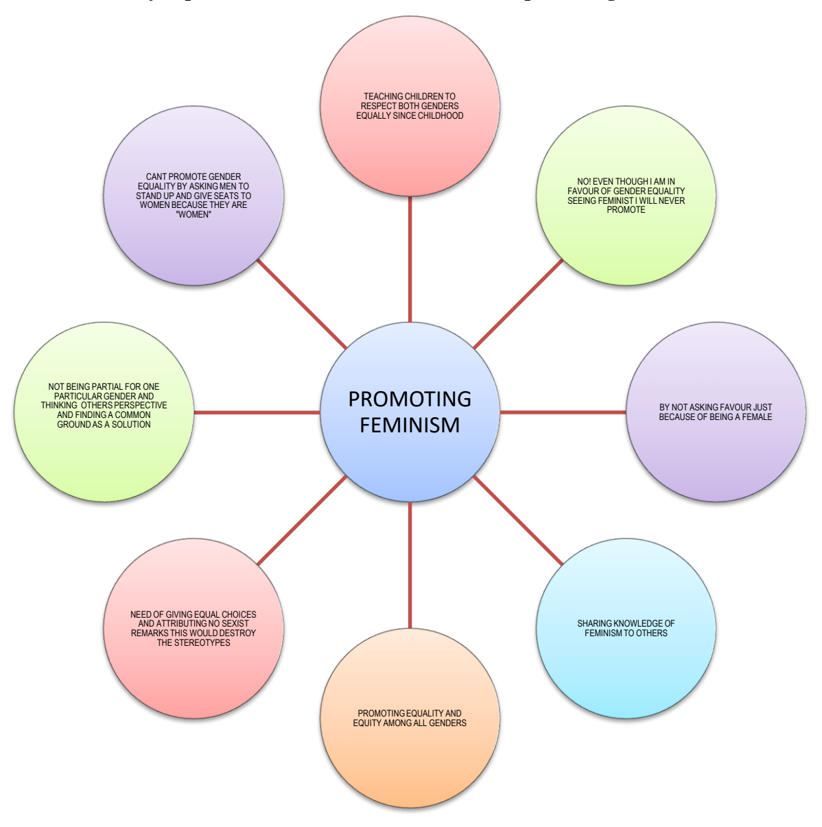
Question 10: How will you promote feminism so that it is seen in a positive light?

80% say yes to this, 10% say no, 10% are unsure.